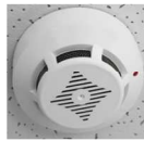
Fire / smoke detection