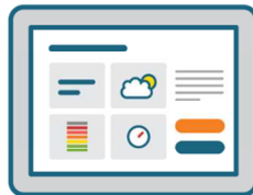
Energy consumption manager